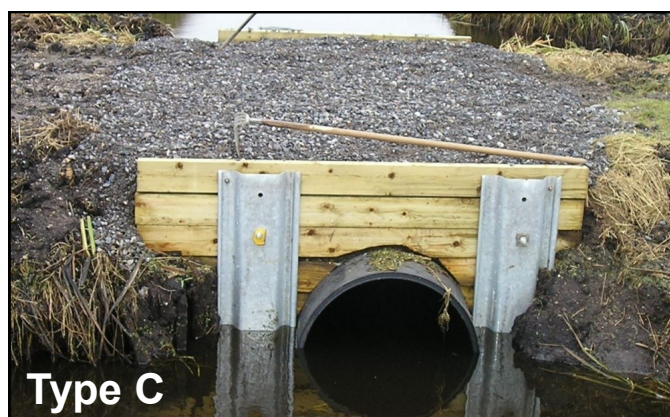
Timber and trench sheet headwall (with tie bars)