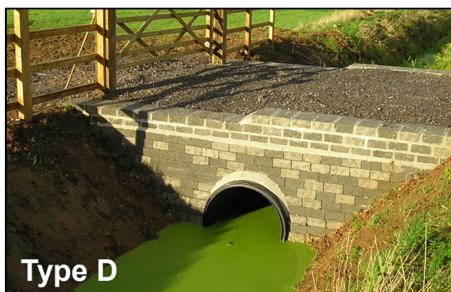
Concrete block headwall (full)