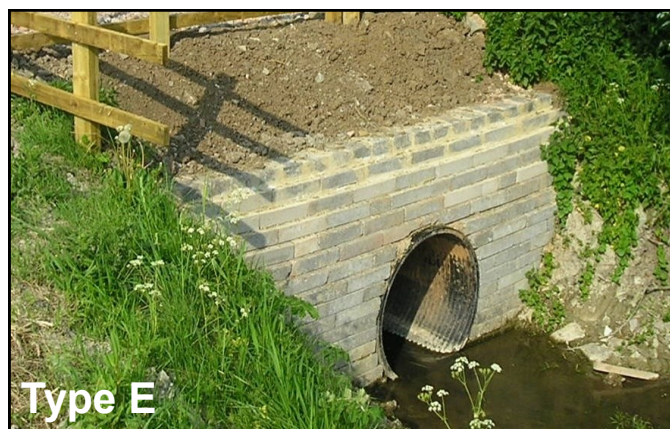
Concrete block headwall