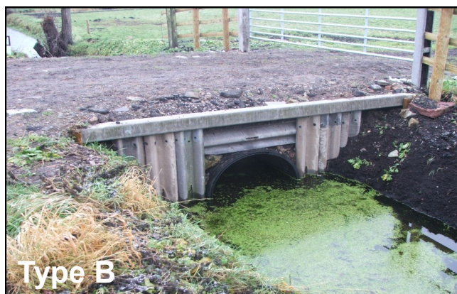
Steel (motorway barrier) headwall