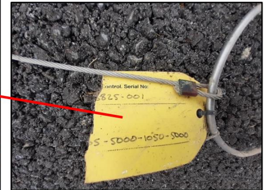
Asset tag - damaged