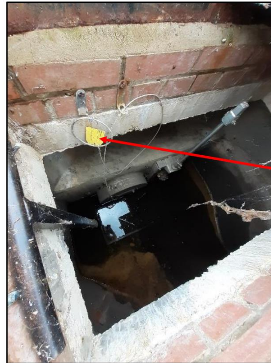
Flow Control Device (lhs) & Penstock valve (rhs)