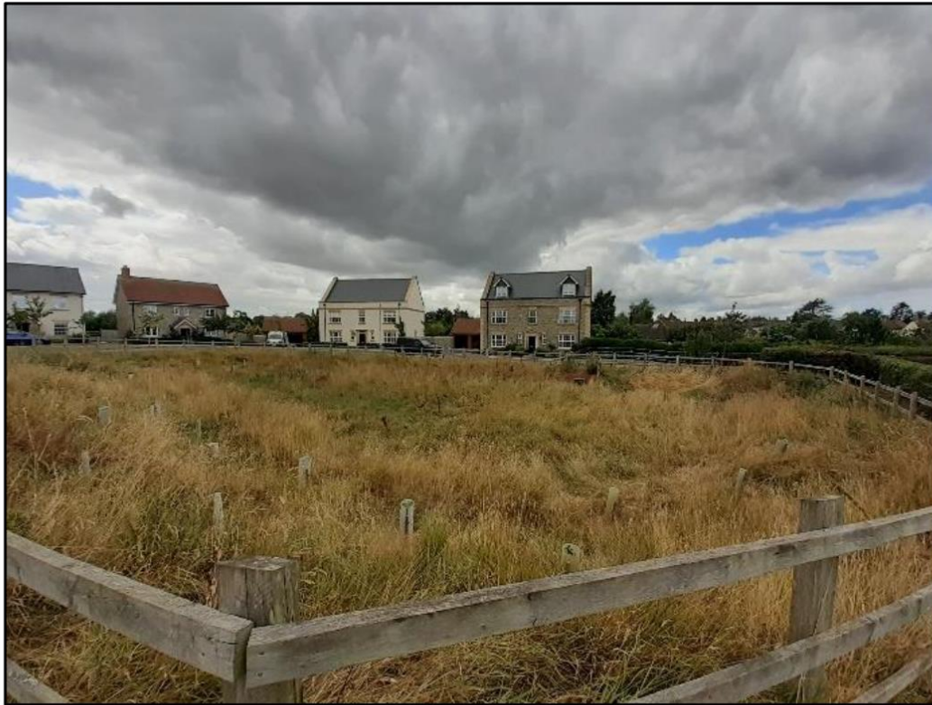
Attenuation Basin - looking west (towards Combined Headwall inlet/outlet)